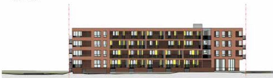
02 (000) SE Elevation SCALE 1 : 200