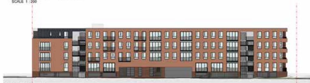
02 (000) SW Elevation SCALE 1 : 200