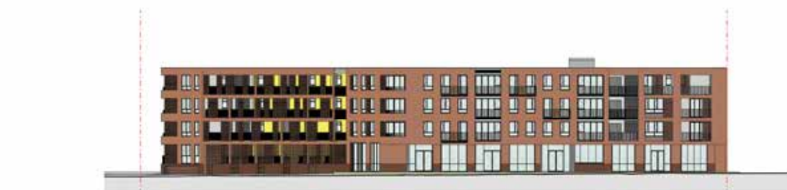
02 (000) NE Elevation SCALE 1 : 200