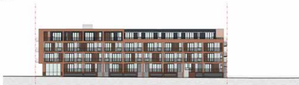
02 (000) NW Elevation SCALE 1 : 200